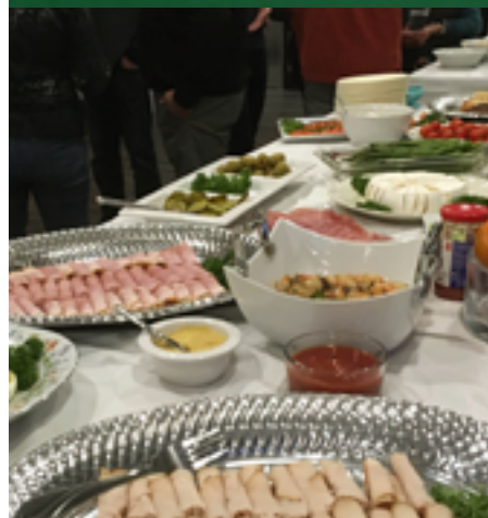
...and the lovely spread he prepared