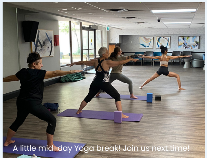
A little mid-day Yoga break! Join us next time!