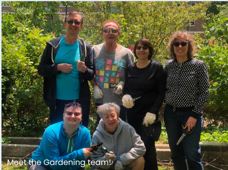
Meet the Gardening team!