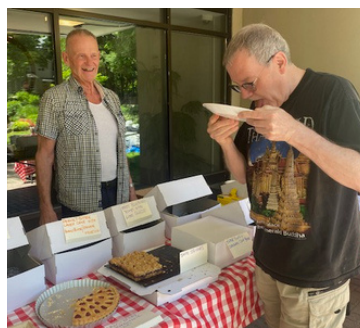
.50 cents to lick the plate